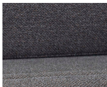
+ Upholstery Melia