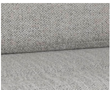
+ Upholstery Samir