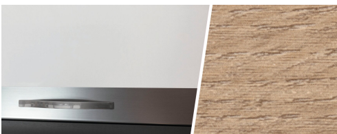
+ Wood décor Amberes Oak