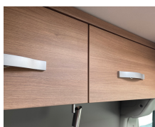
+ Wood décor Cape Town