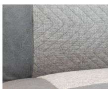
+ Upholstery Hygge