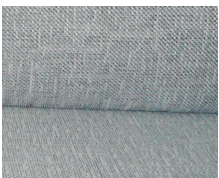
+ Upholstery Drake