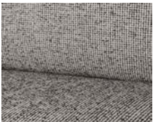
+ Upholstery Saros