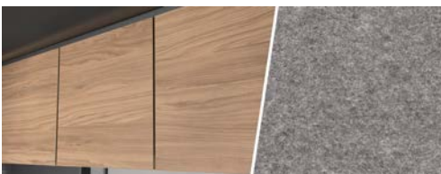
+ Wood décor Ashton