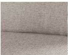
+ Upholstery Heron (partial textile-leather) ○