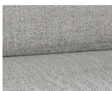
+ Upholstery Samir