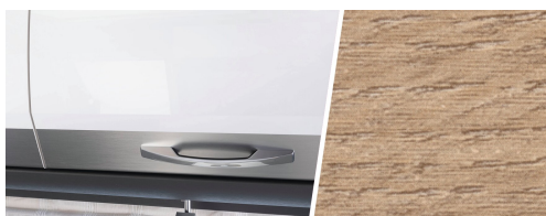
+ Wood décor Amberes Oak