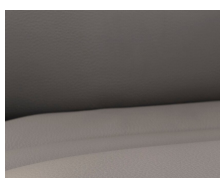
+ Real leather upholstery Colin ○