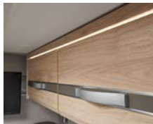
+ Wood décor Noce Nagano, additional decor Web pebble grey