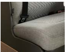
+ Upholstery Scandi