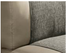
+ Upholstery Camino