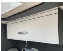
+ Wood décor Amberes Oak ○